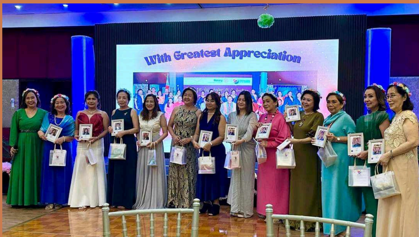
The Club Members enjoying dance and laughter during the night of awards and recognition